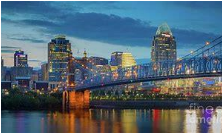
Greater Cincinnati, Ohio Friendship Force Club