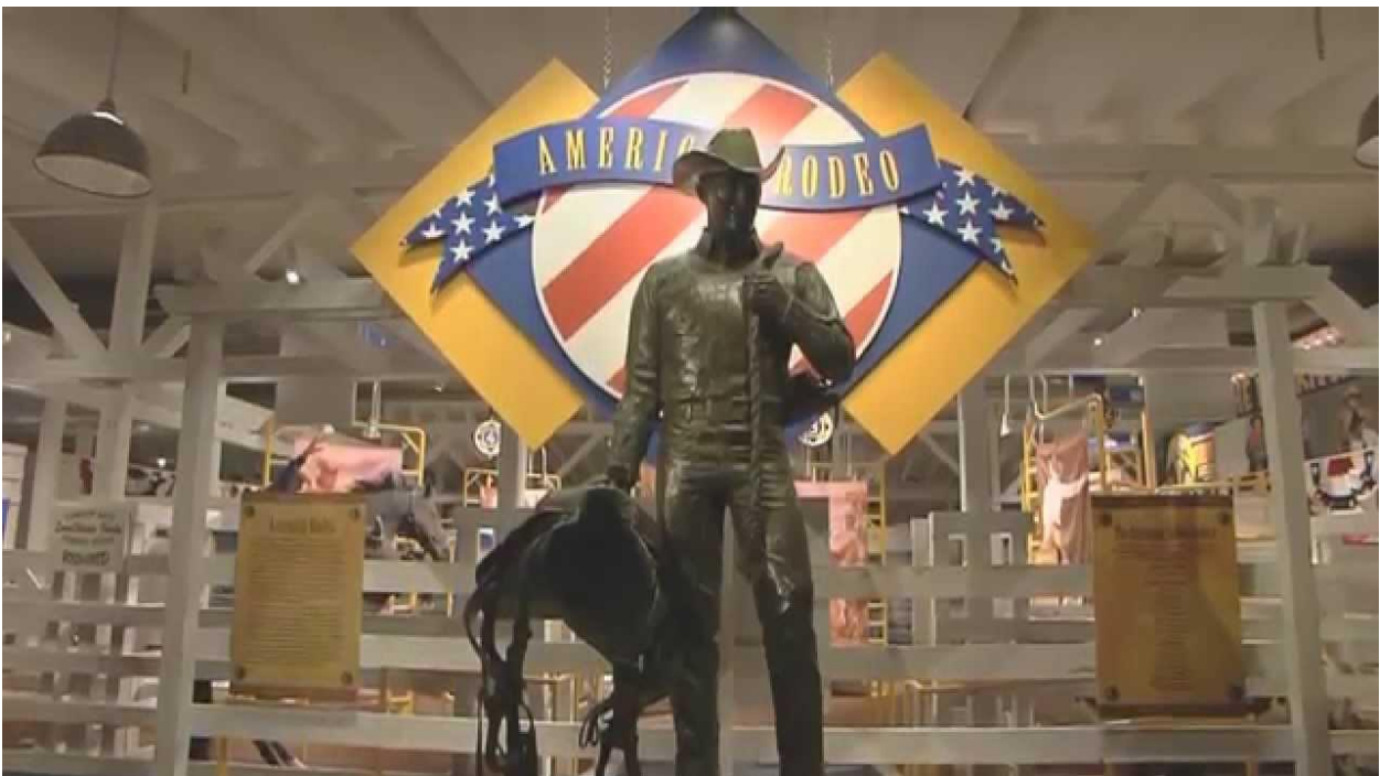
Oklahoma City, Oklahoma Friendship Force Club