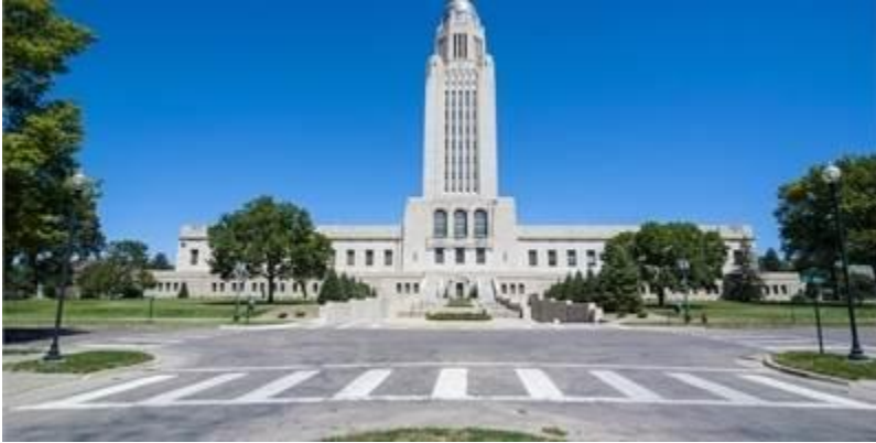
Lincoln, Nebraska Friendship Force Club