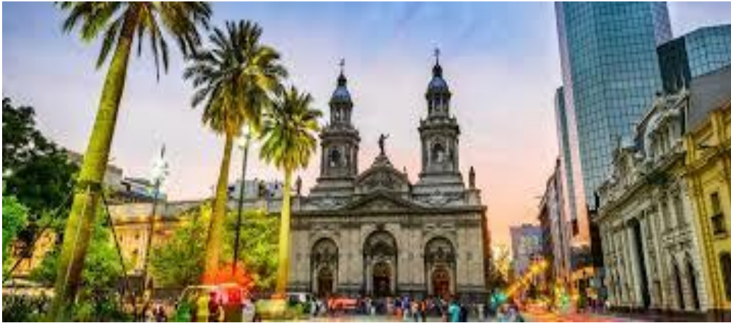
Santiago, Chile Friendship Force Club