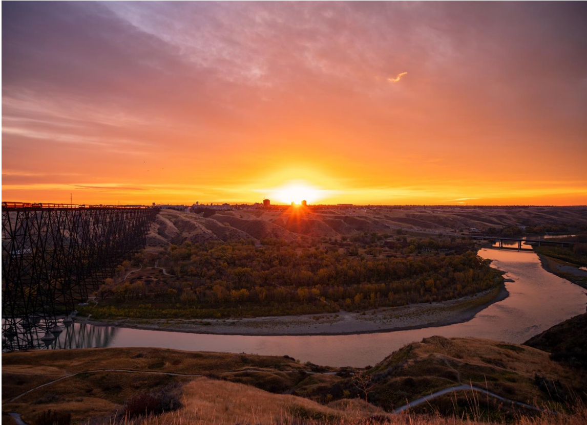
A photo taken at sunset in beautiful Lethbridge, Alberta, Canada