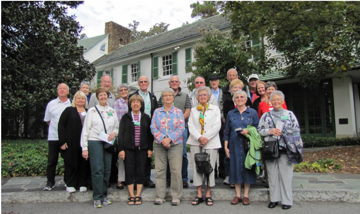
Hosts and guests from Pike'sPeak FF, Colorado pause for a group photo in front of Reynolda House.